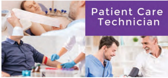
Patient Care Technician

Patient Care Technician is the combination of: CNA, Phlebotomy and EKG.